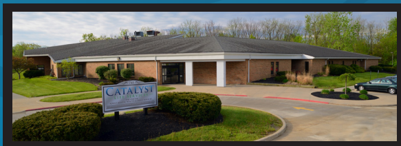
THE CENTER 741 Scholl Rd, Mansfield OH 44907 (419) 756-1717

“CATALYST LIFE SERVICES IS AN AGENT OF CHANGE, GUIDING THE PEOPLE WE SERVE TO LEAD MORE FULFILLING LIVES.”