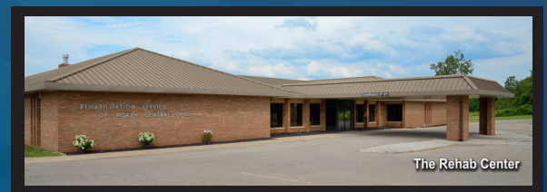
The Rehab Center

THE CENTER FOR INDIVIDUAL AND FAMILY SERVICES 741 Scholl Rd, Mansfield OH 44907 (419) 756-1717