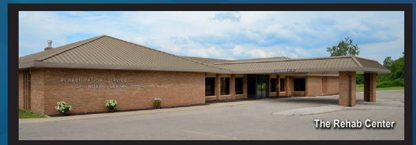
The Rehab Center

THE CENTER FOR INDIVIDUAL AND FAMILY SERVICES 741 Scholl Rd, Mansfield OH 44907 (419) 756-1717